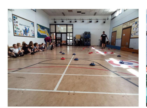
New Age Kurling