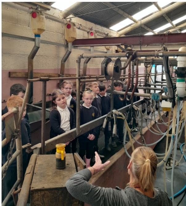
Please see more photographs on our Facebook page

It's been a busy week here at Beechwood. Year 3 visited a local farm on Wednesday and had a fantastic time. They learnt about the processes involved from getting food from the farm to a plate and the impact the environment is having on farming today.