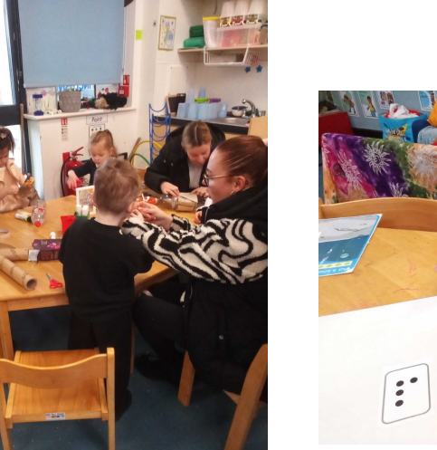
We made junk model rockets,